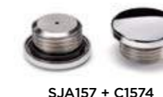
SJA157 + C1574