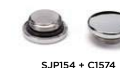
SJP154 + C1574